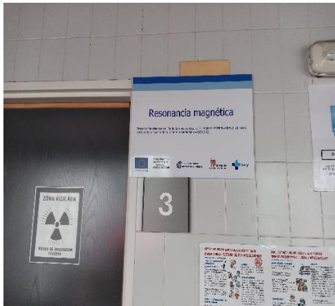
Equipment access view

The corresponding informative plaque has been placed in the building in order for the ordinary building users, whether staff or the public who come to seek assistance, to be informed that the intervention carried out has been co-financed by the ERDF.